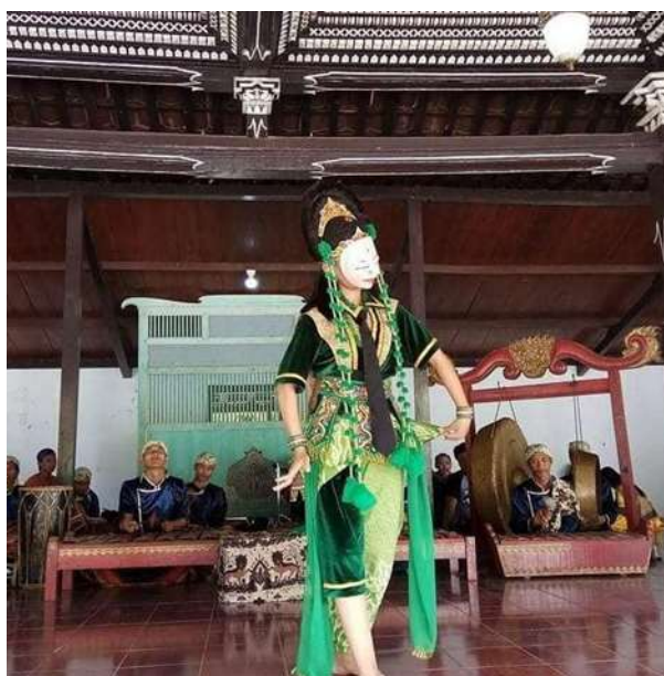
Figure 4. The Rumyang Mask Performance Place at the Kacirebonan Palace