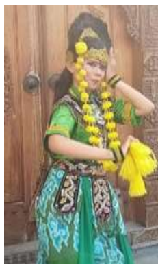
Figure 2. Rumyang Mask Dance Dress

The head is wearing a sobrah, with the shape of a suru secandik, a drum searip, and a merang segedeng, the body part is wearing a mask (shirt and pants material) kutung shirt, sontog pants, lids, krodong, cloth, badong, keris, bracelets, and scarves or sampur. The color of the clothes used corresponds to the character of the mask (usually green), the legs wear kringing bracelets. The following is the dress code used in the Palimanan Style Cirebon Rumyang Mask Dance: