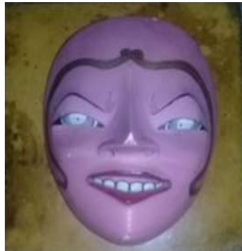
Figure 3. Mask of Rumyang

The property used is the Rumyang Mask Dance. The Rumyang Mask Dance is generally pink in color and has blue cheeks, but the Palimanan Style Cirebon Rumyang Mask Dance has gold cheek decorations. The Palimanan style Rumyang mask also depicts a more mature character than the other Cirebon style Rumyang mask dances. Here is a picture of the Palimanan Style Cirebon Rumyang Mask: