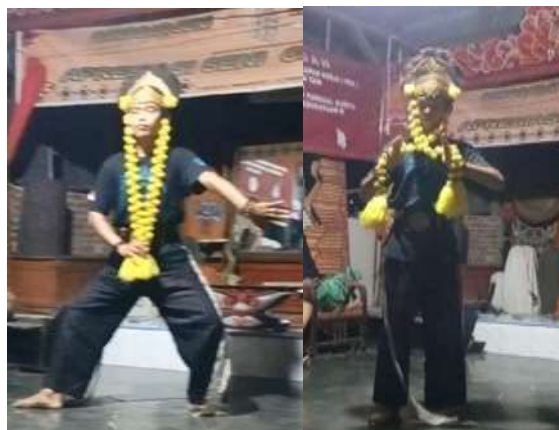
Picture. 7 left is godeg discarded rawis, right is godeg telunjong