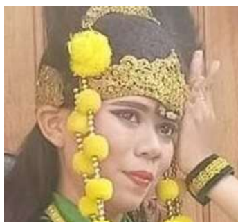
Image 1. Rumyang Mask Makeup.

The Rumyang Mask Dance is a dance that uses a mask from the beginning of the performance to the end, therefore the make-up used is only the basic tools used, such as basic powder, powder, eyebrows, and lipstick only. you can see the following picture which is the makeup of the Rumyang mask dance: